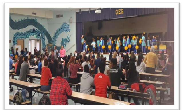
A few snapshots from the festivities